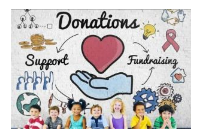
Fall Fundraising Drive 2020 - Latest Update

Monday, September 28th 10:00am - Afterschool Program Registration, Opens for Debate Club and Drama Club (find more info below in Community News) Tuesday, Sep 29th 12:30-1:00 pm - Principal Birthday Lunch (September Birthday) Wednesday, Sep 30th 3:00-5:00 pm - Ice Cream Social (New Date Due to Rain) Thursday, Oct 1st 9:00-11:00 am - Virtual Principal/Parent Connect Wednesday, Oct 7th 9:40 am - Somerset October Assembly Friday, Oct 9th - Professional Development Day No School